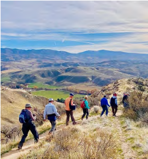
Wednesday hikers visit Cartwright Ranch, Polecat Trail, Camel's Back Trails, and Eagle Island State Park. Eagle Island hikers got to witness snowmaking for the sledding hill (photo below).